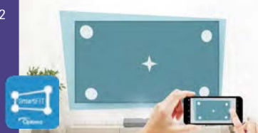
Image alignment system ensures hassle free setup using a smartphone.